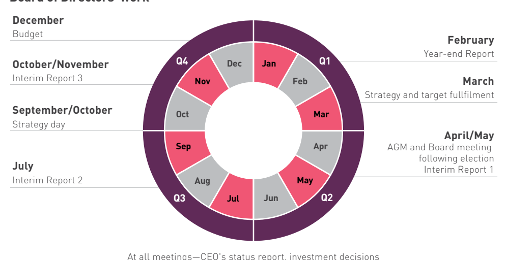
At all meetings—UEU's status report, investment decisions

CORPORATE GOVERNANCE REPORT Fingerprint Cards AB 2018